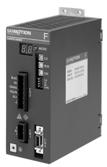
Fig. 2 Driver